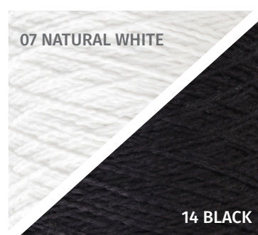
07 NATURAL WHITE