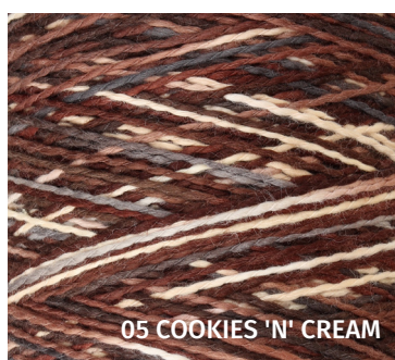
05 COOKIES 'N' CREAM