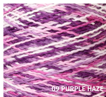
09 PURPLE HAZE