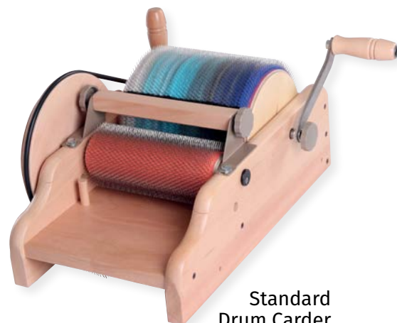
Standard Drum Carder