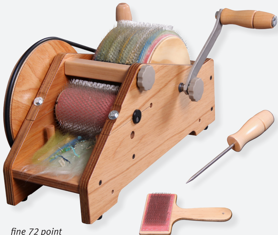
fine 72 point

Create beautiful, fun, funky & wild batts. Add wool, silk, cocoons, noils, ribbons, bits, pieces and more... Portable, affordable and suitable for all your fibres.