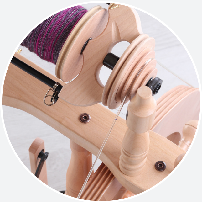
A polycord driveband for fuss free ratio changing. Four ratios to choose from 5, 7, 9 and 15:1