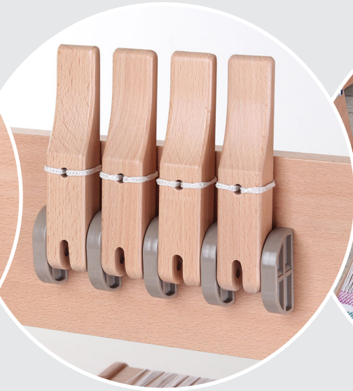
Smooth action, light levers