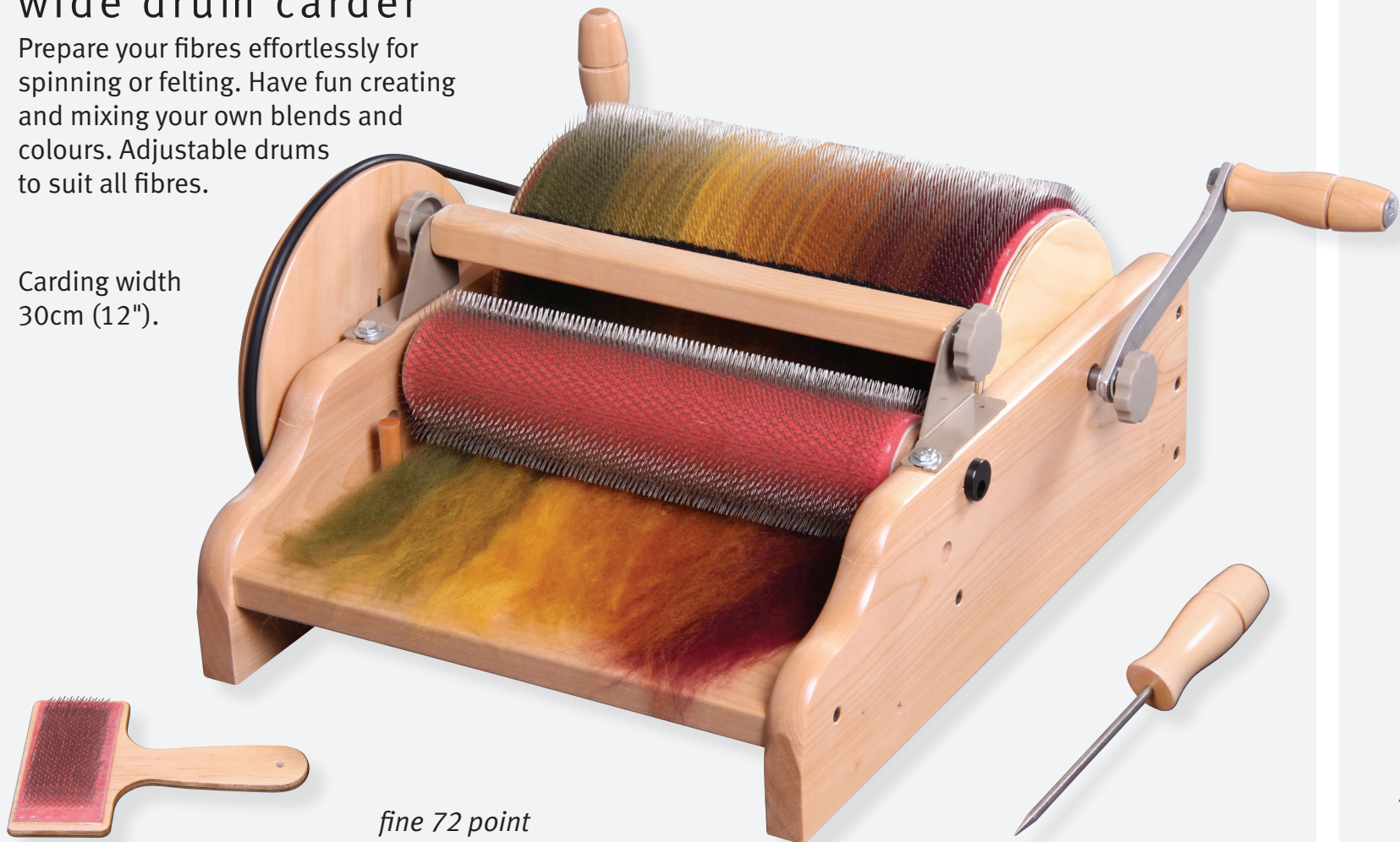
fine 72 point