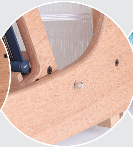
Split pins hold reed in place when sleying