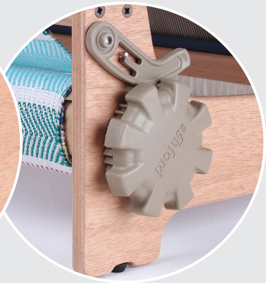
Strong nylon ratchets, handles and pawls