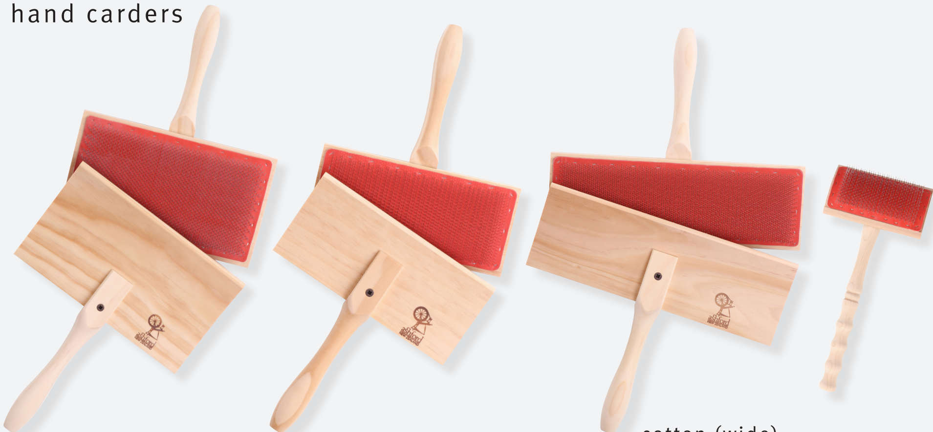
classic hand carders fine 72 point or superfine 108 point