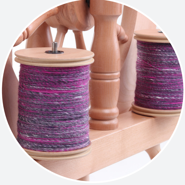
Built-in lazy kate