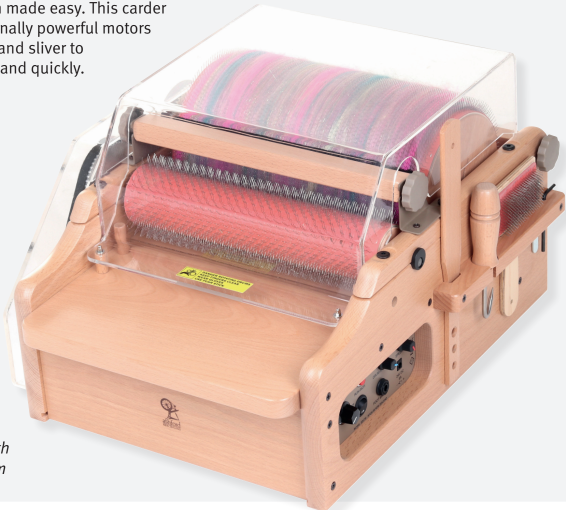
fine 72 point teeth on the main drum