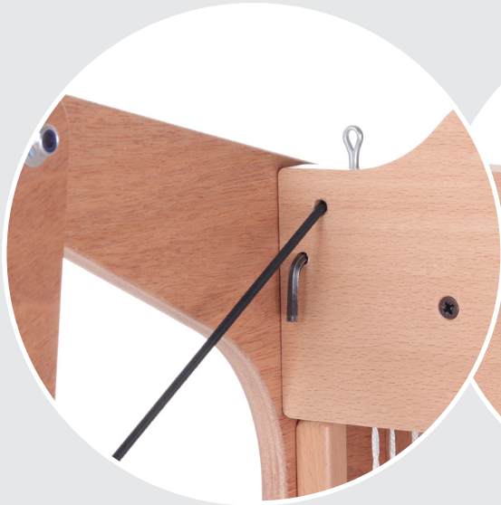
Bungee cords for auto bounce-back, storage for hex wrench and split pins