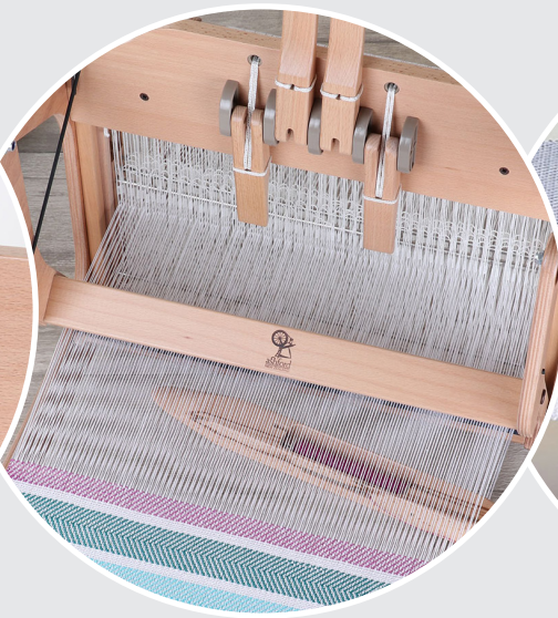
Smooth, quiet overhead beater with auto bounce-back