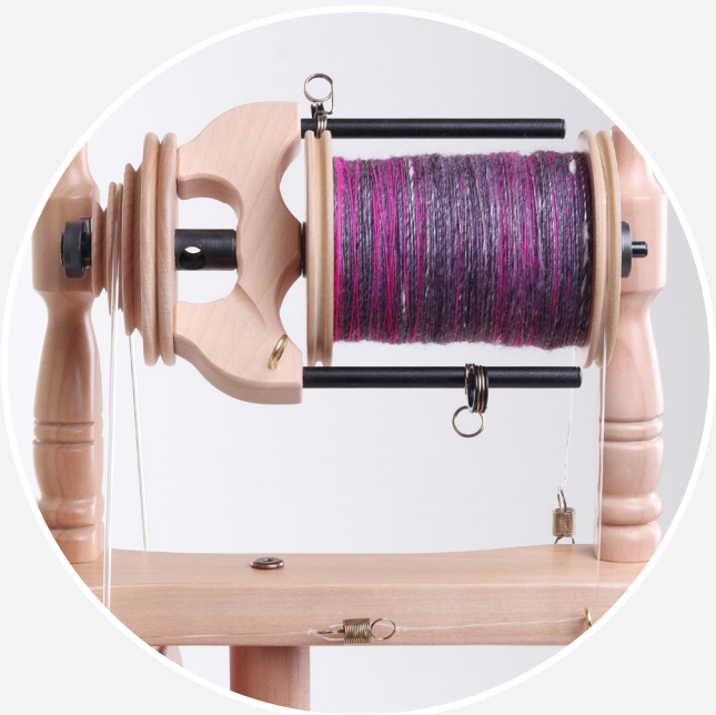
Sliding hook flyer and large capacity bobbins